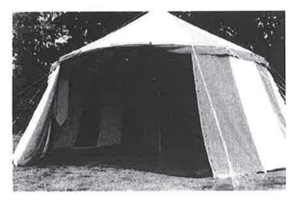
Grand Round Pavilion on its own